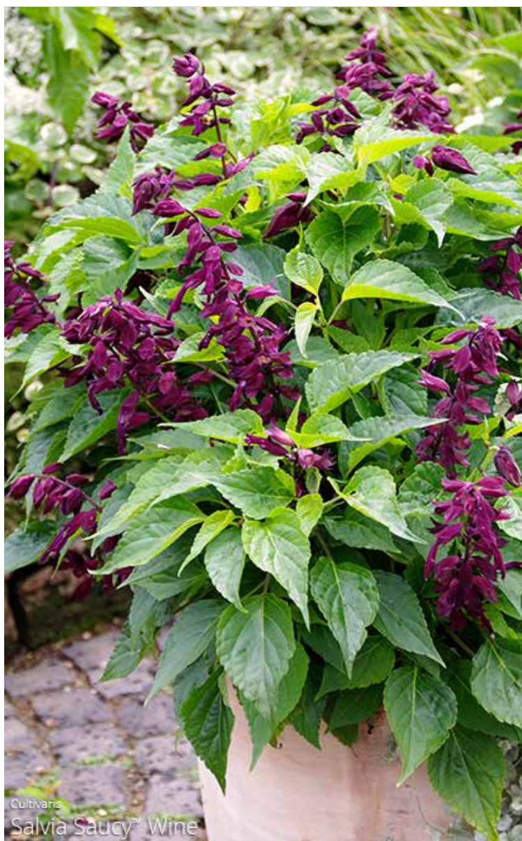
Cultivars Salvia Saucy™ Wine