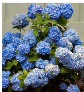
DEAR DOLORES ™ Hydrangea

Traditional Characteristics: Blooms only once a year; if pruned incorrectly, not at all