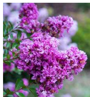
EARLY BIRD ™ Crapemyrtles

Traditional Characteristics: Blooms only in summer