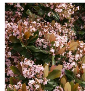
ROSALINDA ® Indian Hawthorne

Traditional Characteristics: Medium growth size