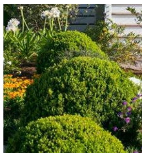
BABY GEM ™ Boxwood

Rhododendron 'QbackB' PP27083 Rhododendron 'QbackA' PP27082 Rhododendron 'QbackC'