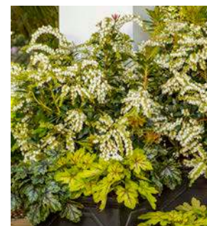
MOUNTAIN SNOW™ Pieris

Nandina domestica 'AKA' PP19916 Nandina domestica 'Murasaki' PP21391 Nandina domestica 'Seika' PP21891