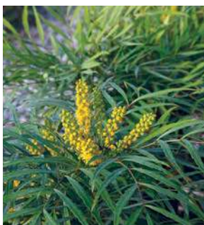
'SOFT CARESS' Mahonia

Traditional Characteristics: Wild growth habit with lots of spines