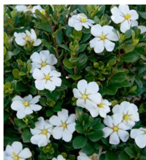
SCENTAMAZING ™ Gardenias

Traditional Characteristics: Yellowing foliage and low bloom count