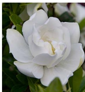
JUBILATION ™ Gardenias

Traditional Characteristics: Yellowing foliage and low bloom count