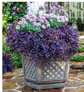
PURPLE DAYDREAM® Dwarf Loropetalum

Traditional Characteristics: Grows very large; expensive and time-consuming to control