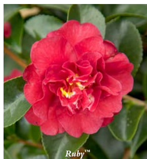
OCTOBER MAGIC ® Camellias

Buxus microphylla japonica 'Gregem' PP21159