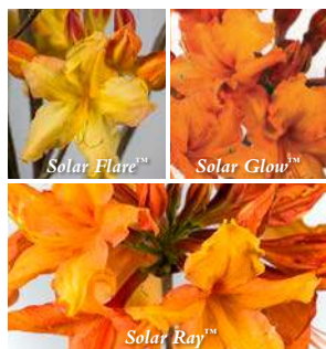
SUNBOW ® Native Azalea Series

Enjoy this preview list of a larger variety of customer preferred and specifically improved plants.