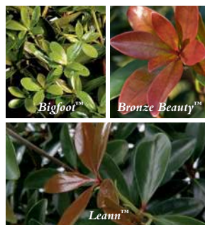
SOUTHERN LIVING ® Cleyeras

Traditional Characteristics: Inconsistent growth heights resulted in uneven hedge or screen rows