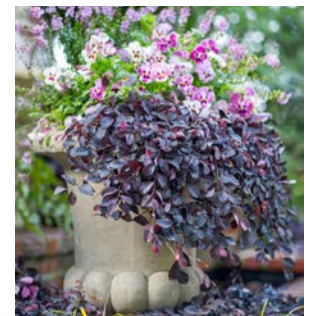
PURPLE PIXIE® Dwarf Weeping Loropetalum

Traditional Characteristics: Grows very large; expensive and time-consuming to control