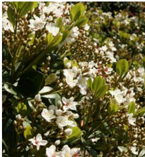
SPRING SONATA™ Indian Hawthorne

Enjoy this preview list of a larger variety of customer preferred and specifically improved plants.